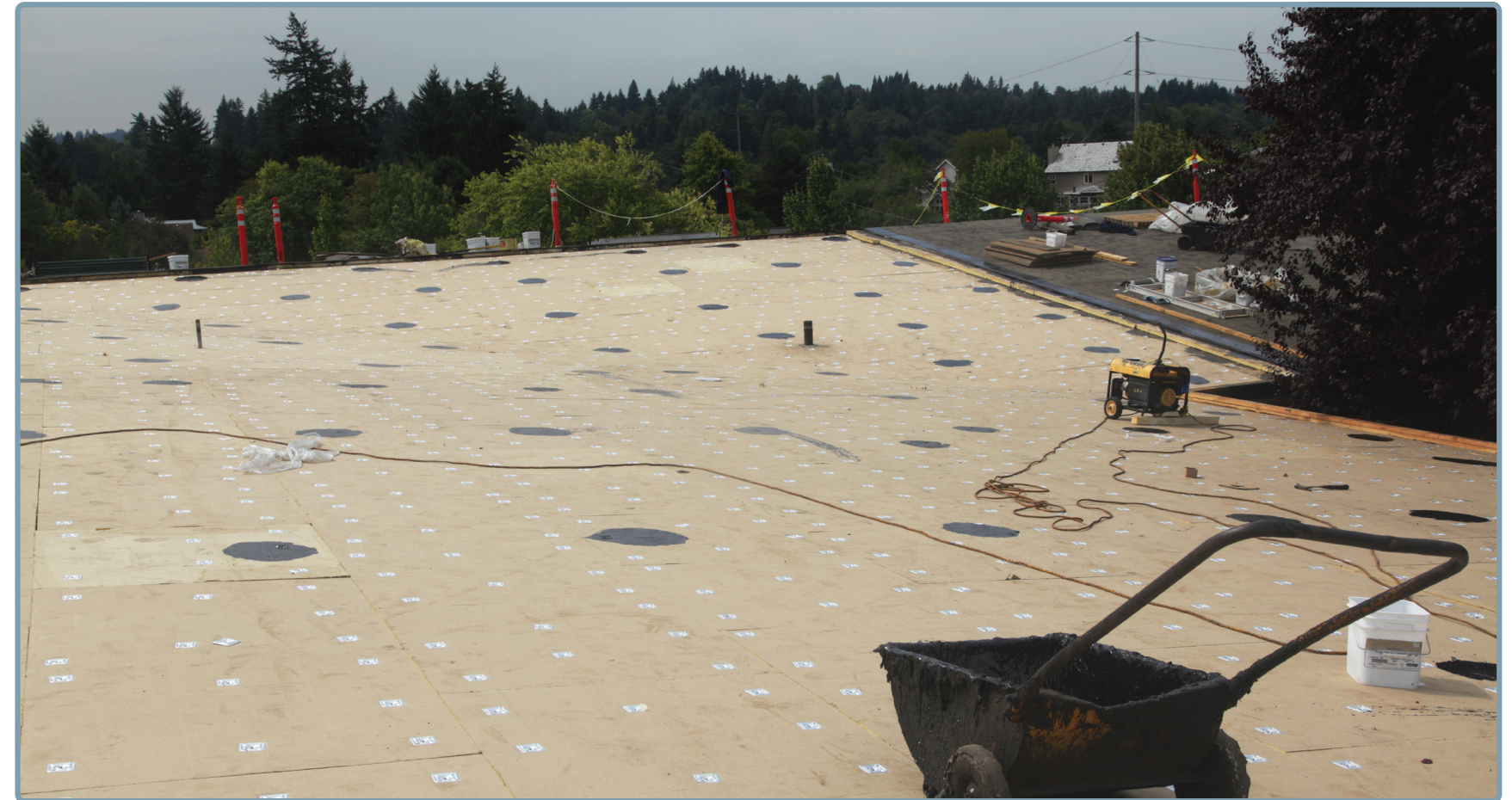
Removing the old roof materials and installing roof-level seismic upgrades.