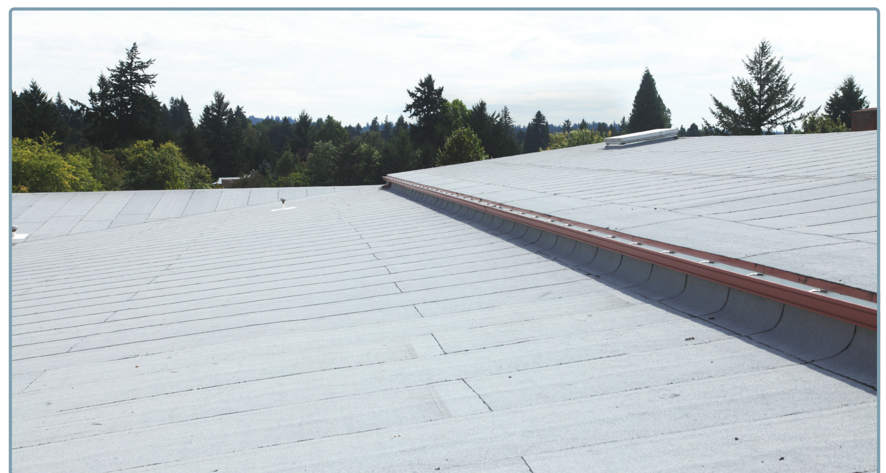
Bridlemile K-5 is one of five schools that were successfully upgraded this summer.

All the work was completed on time and on budget. Over the next 8 years, Portland Public Schools will upgrade up to 63 schools.